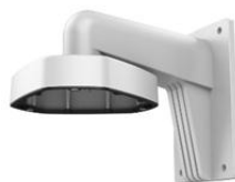
DS-1273ZJ-DM25 Wall mount