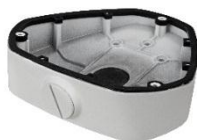
DS-1281ZJ-DM25 Inclined ceiling mount