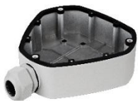
DS-1280ZJ-DM25 Junction box