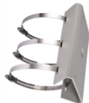
DS-1275ZJ Vertical pole mount