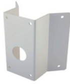
GBR-CM01 Corner Mount Adapter