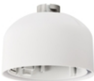
GHO-M018 External housing, for vandal-resistant, IP dome camera