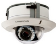
GBR-IC02 Flush-Mount Adapter for Vandal-Resistant IP Dome Camera