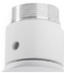
GBR-AM02 Adapter Ring for Pelco Pendant Mount with 1,5" NPT thread