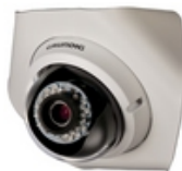
GBR-CM02 Corner Mount Adapter for Vandal-Resistant IP Dome Camera