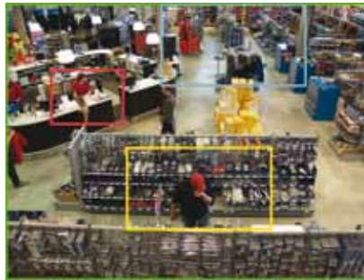
Full overview enabling cropped view areas