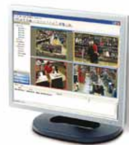
Multiple virtual camera views (up to eight views possible)