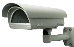
VERSO COMPACT + WBOV