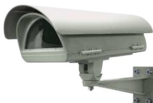
VERSO COMPACT + WBJ