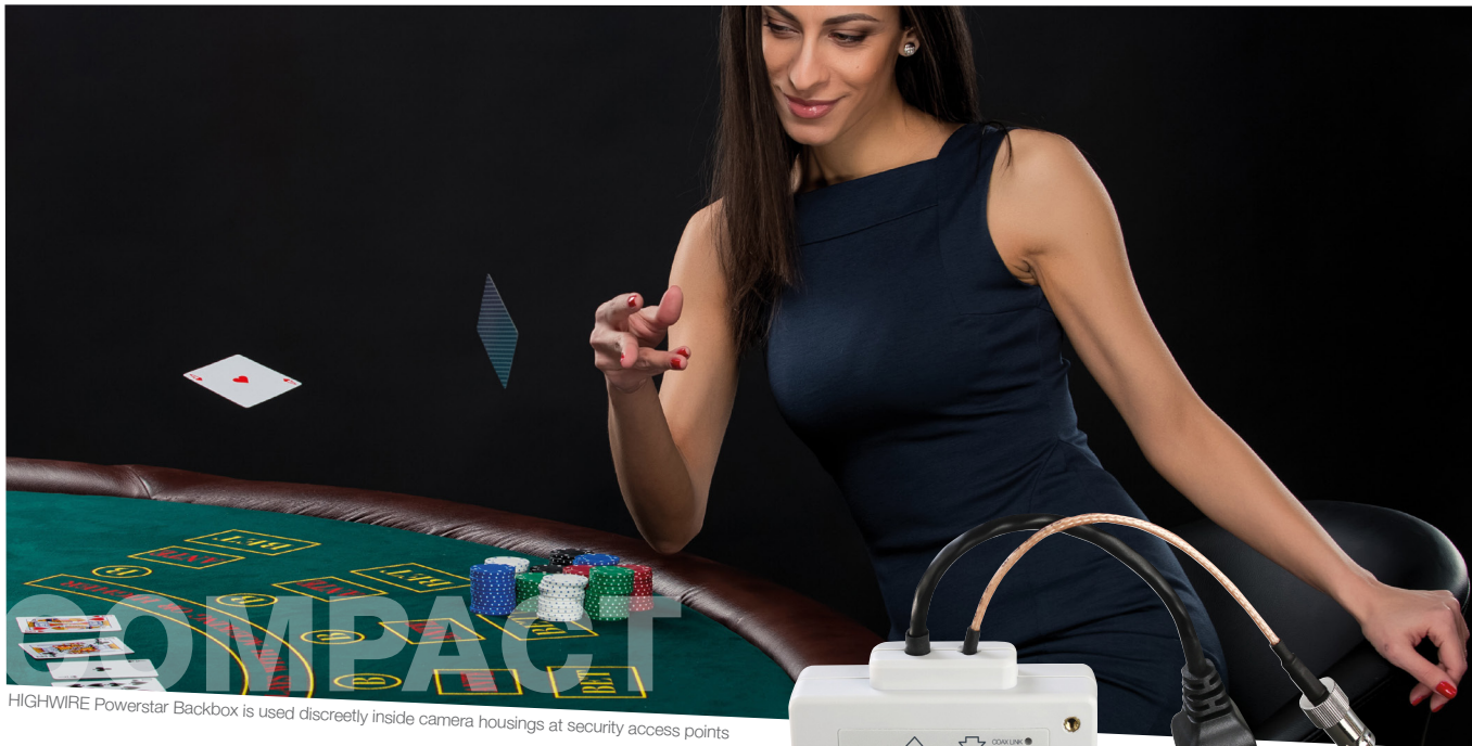
HIGHWIRE Powerstar Backbox is used discreetly inside camera housings at security access points