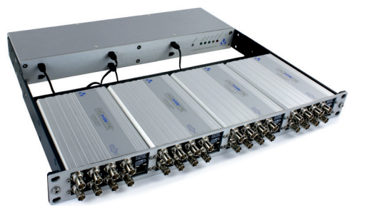
Rackmount | Four rack-mounted HIGHWIRE Powerstar Base 8 units assembled with a Veracity 1U PSU.