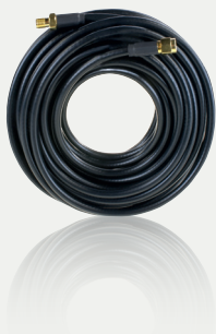
TIMENET Pro Antenna Extension Cable 10 metres