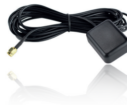
TIMENET Pro comes with antenna and 5 metre cable included