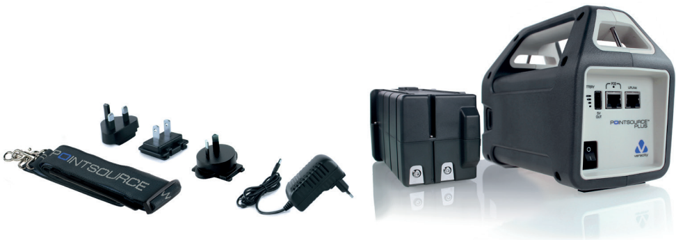
IP CAMERA INSTALLATION TOOL COMPARISON TABLE

POINTSOURCE Plus has a battery life of 3 to 5 years, or 200 - 1000 cycles depending upon discharge depth and operating temperature. The battery status indicator shows the remaining charge in steps of 25%. The simple design of the system allows the removable battery to be recharged whilst POINTSOURCE Plus continues to be used with a second battery.