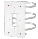
WV-QPL500-W Mount Bracket