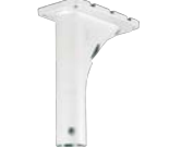
WV-QCL501-W Mount Bracket