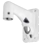
WV-QWL501-W Mount Bracket