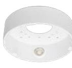
WV-QJB505-W Base Bracket