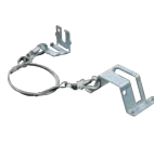
WV-Q105A Mount Bracket