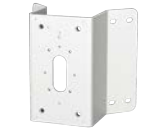
WV-QCN500-W Mount Bracket