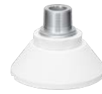
WV-QSR506M1-W Mount Bracket