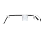
WV-QCA501A I/O Cable