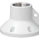
WV-QCL100-W Mount Bracket