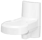
WV-QWL502-W Mount Bracket