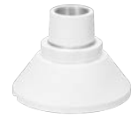
WV-QSR506F-W Mount Bracket