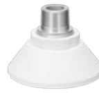
WV-QSR506M-W Mount Bracket