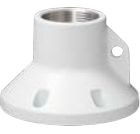
WV-QCL101-W Mount Bracket