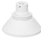
WV-QSR506-W Mount Bracket